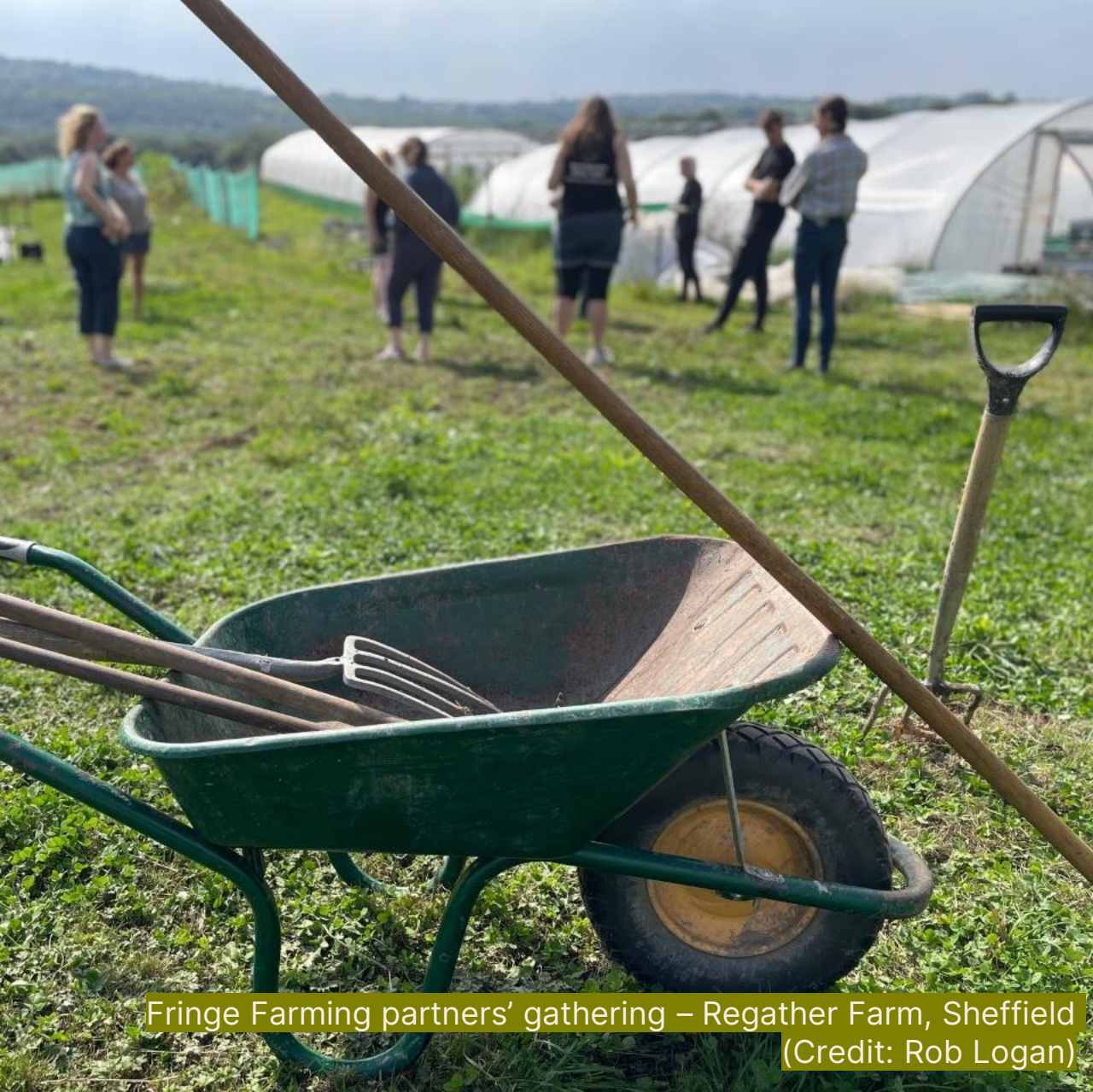
Fringe Farming partners' gathering – Regather Farm, Sheffield