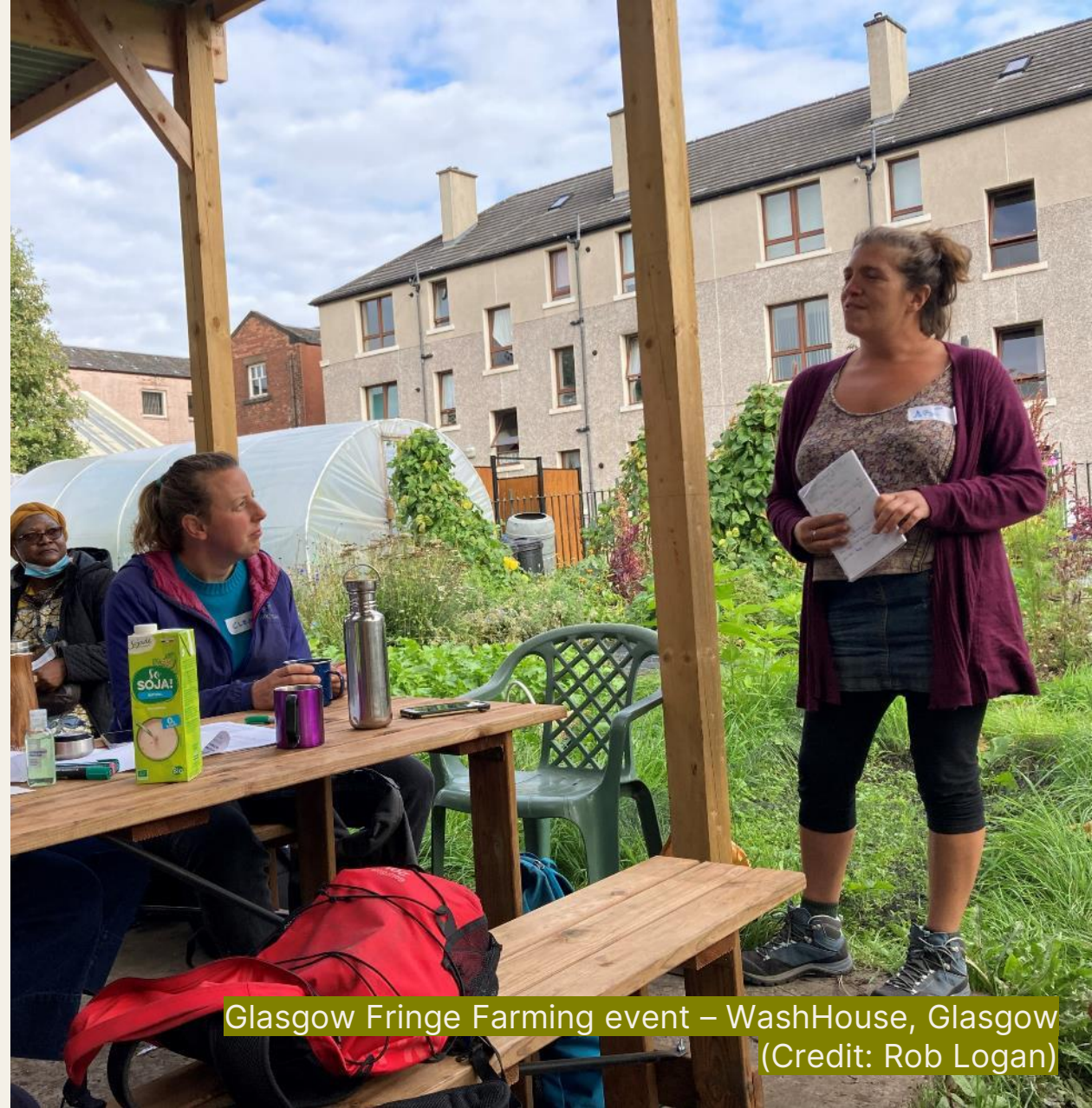
Glasgow Fringe Farming event – WashHouse, Glasgow