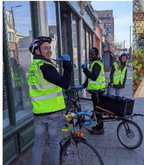
Cargo riders and Cycle