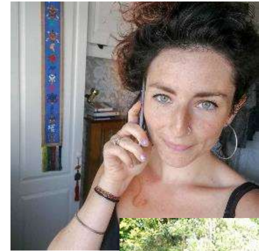
Welfare Phone calls