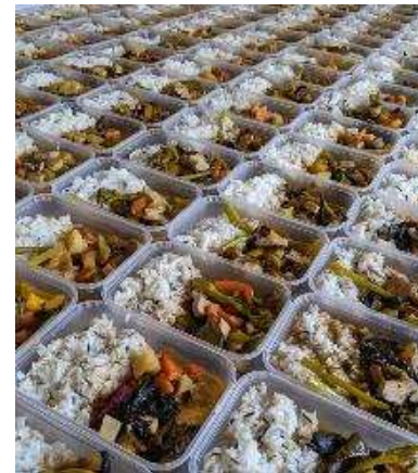
500 meals / day with Angelina restaurant