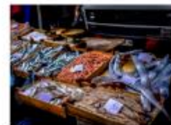
EAT Top of the swaps: five fish to avoid a what to eat instead