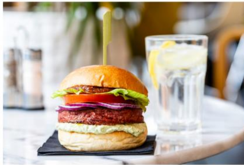
PICTURE: MOVING MOUNTAINS B12 BURGER BY MILES WILLIS Published: 11/09/2018