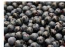
COOK Food Hunt: Summer's seasonal softies